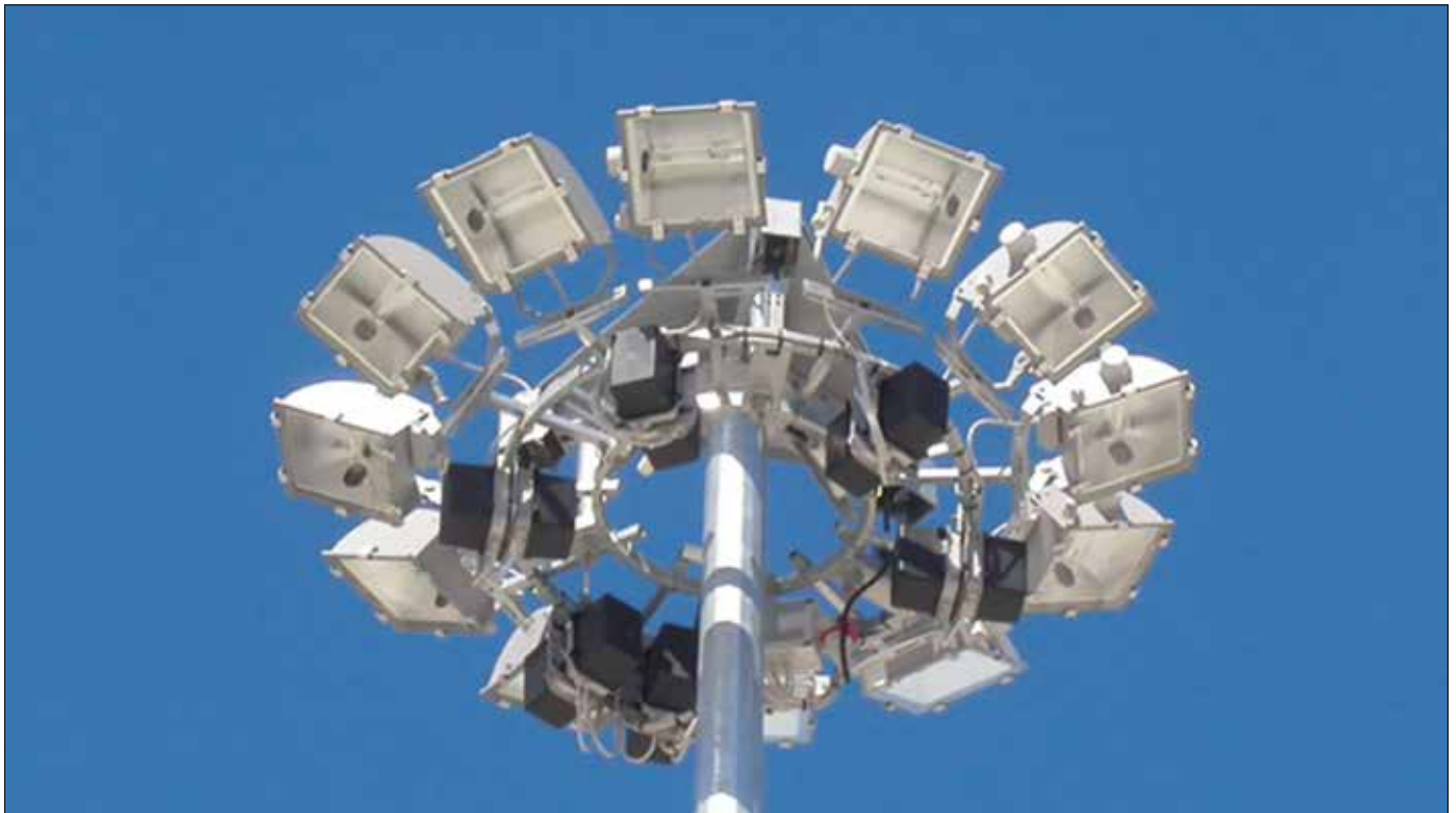
LIGHTING MASTS WITH MOBILE CROWN FOR EXPLOSION PROOF FLOODLIGHTS EEX D IIB T3 IP65

Installation: hazardous areas - Zone 1/2 (Gases) - Zone 21/22 (Dusts) - Safe Area